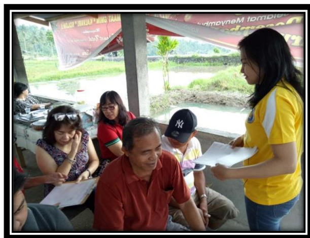
Picture 2. a photo of financial management training for chicken farming SMEs.

The training provided by LPM STIE Petra has a positive impact on financial management in SMEs of the Digital-Based Chicken Farmer Group. After attending training on the use of Microsoft Excel in the preparation of financial statements, SME managers showed a better understanding of the importance of well-structured financial statements. They now better understand how to create income statements, balance sheets, and cash flow statements more easily and efficiently using this software. This improvement in skills allows managers to generate more accurate, timely, and useful reports for further analysis that is beneficial for business planning. The following is a photo of financial management training for chicken farming SMEs.