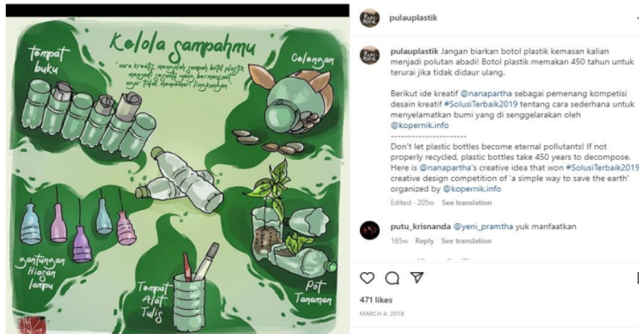
Figure 2. Posts About Waste Management