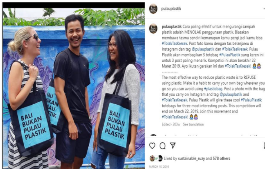
Figure 3. Posts About Avoid Plastic Bag