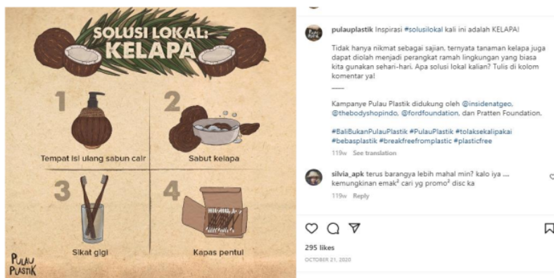
Figure 1. Posts About Local Solution