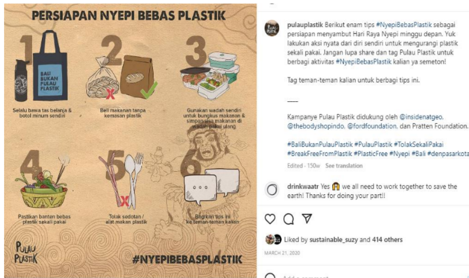
Figure 5. Posts About Nyepi