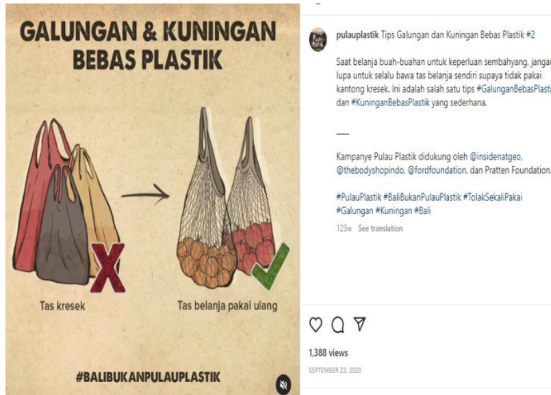
Figure 5. Posts About Galungan and Kuningan Plastic Free